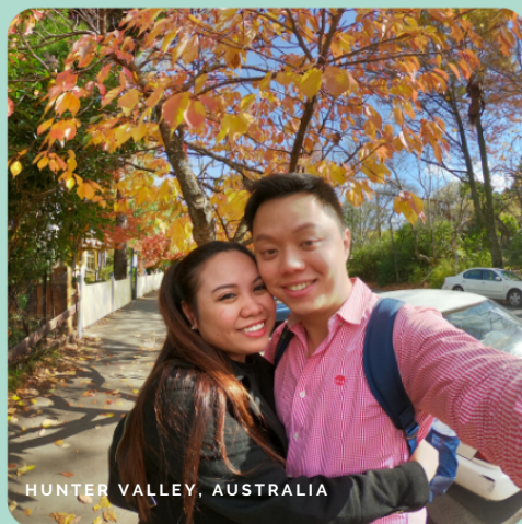
HUNTER VALLEY, AUSTRALIA