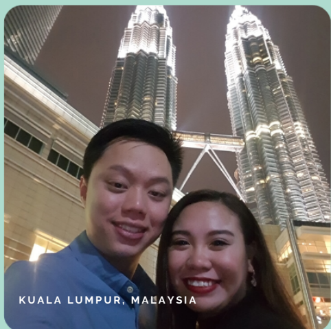
KUALA LUMPUR, MALAYSIA