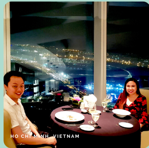
HO CHI MINH, VIETNAM