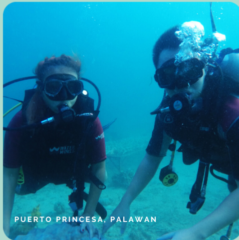
PUERTO PRINCESA, PALAWAN